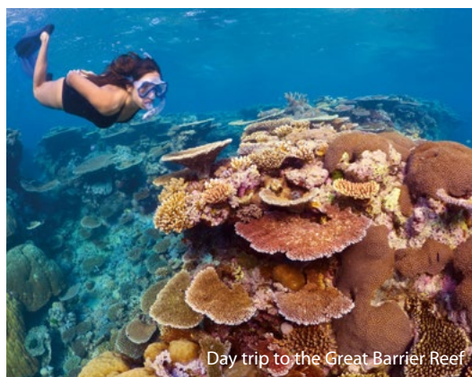
Day trip to the Great Barrier Reef

Note: Beach Club does not cater for guests under the age of 18 years. Terms and conditions apply. Additional charges will apply for guests and/or extra bedding. Guests can reconfirm their tours with Hamilton Island Tour Desk upon arrival. Full day cruise and half day cruise are pre-booked on the 2nd and 3rd day of stay.