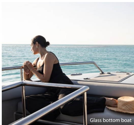
Glass bottom boat