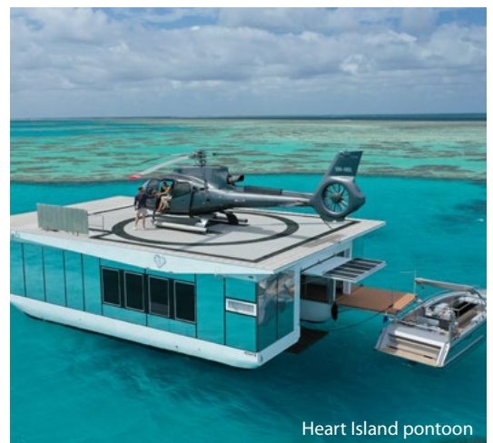
Heart Island pontoon

Blackout dates: Package not available over the dates 17-24 August 2024 and 20 December 2024 - 11 January 2025 inclusive.