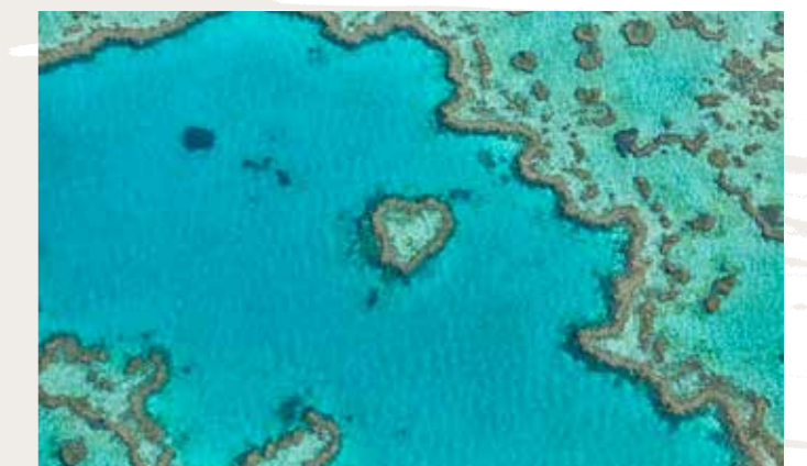
Heart Reef, Great Barrier Reef

Note: minimum night stay requirements apply to all packages. For more packages and information, visit www.qualia.com.au/packages