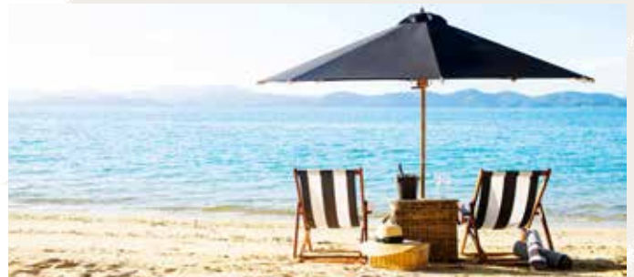
Private beach drop offs