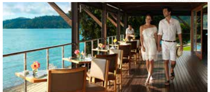
Pebble Beach restaurant